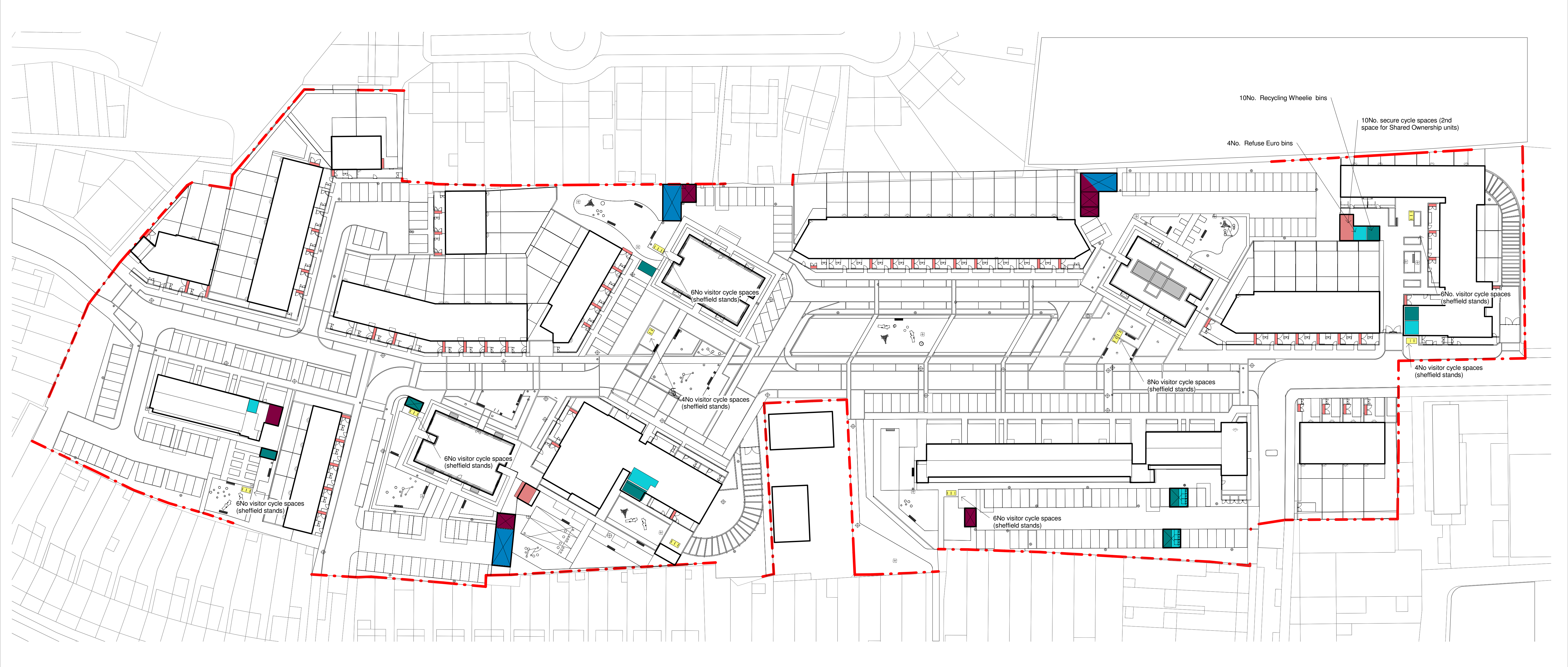
OUTBUILDINGS AND STORAGE